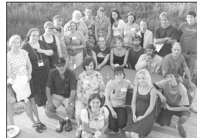
NSEN Class of 2007, ARHS, Newport Landing.