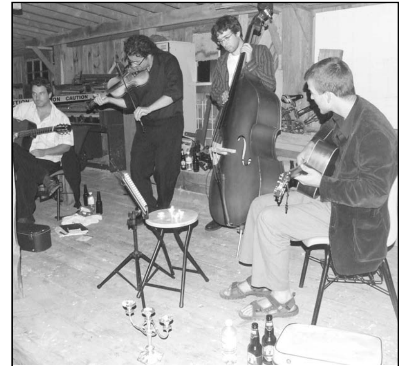
Mishra's Dream from Antigonish delighted visitors and locals to a special performance in the Avon Spirit Shipyard during the NS Environmental Network's annual retreat held in Newport Landing, Avondale in August. More on the NSEN retreat inside.

Where many museums are provided at least a full-time manager or curator, keeping the museum operating to standards a tourism destination requires is truly a labour of love for our volunteer Board of Directors. I'd also like to thank the Board for their hard work to help me run the ship. May she sail another year. From all of us to you and your families this Christmas, we wish you peace and prosperity for the New Year.