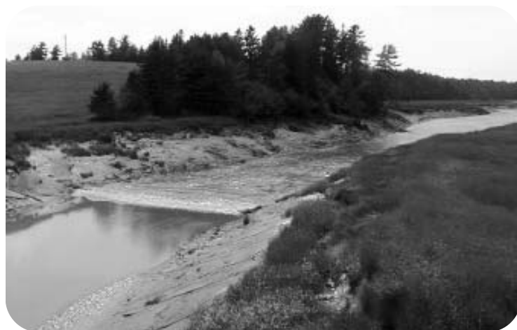
The tidal bore at Mantua Bridge

The Mantua Bridge has long been a stopping spot for tourists and locals alike to view the tidal bore and the unique phenomena of the Bay of Fundy tides.